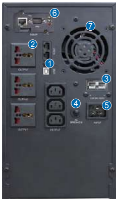
3 kVA (H)